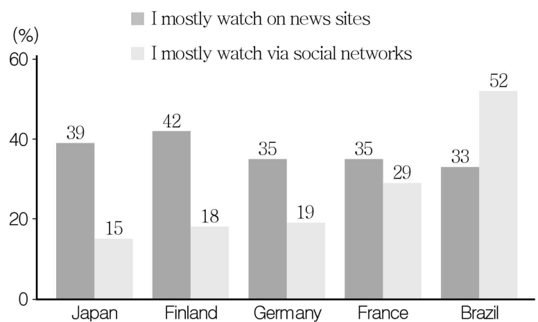
News Video Consumption: on News Sites vs. via Social Networks

The above graph shows how people in five countries consume news videos: on news sites versus via social networks. ① Consuming news videos on news sites is more popular than via social networks in four countries. ② As for people who mostly watch news videos on news sites, Finland shows the highest percentage among the five countries. ③ The percentage of people who mostly watch news videos on news sites in France is higher than that in Germany. ④ As for people who mostly watch news videos via social networks, Japan shows the lowest percentage among the five countries. ⑤ Brazil shows the highest percentage of people who mostly watch news videos via social networks among the five countries.