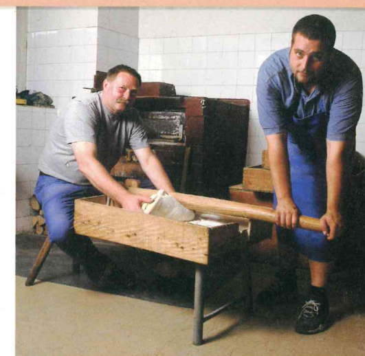
► Licitar makers are rolling out dough.