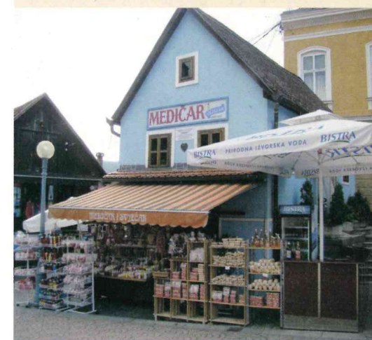
► Gingerbread makers sell various kinds of licitars at their shops.