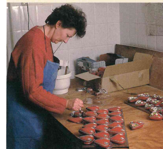
► A woman is decorating heart-shaped licitars .