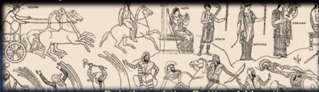
Painting of the Battle of Marathon