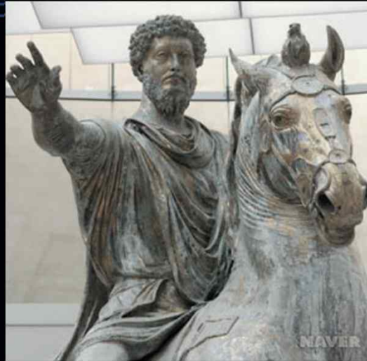
Marcus Aurelius Antoninus

‘얼룩덜룩하게 색이 칠해진 복도(Stoa poikile)’라는 말에서 유래