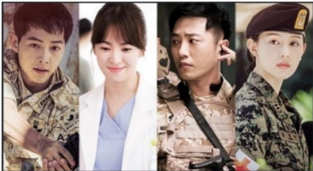
Yoo Si Jin Song Joong K